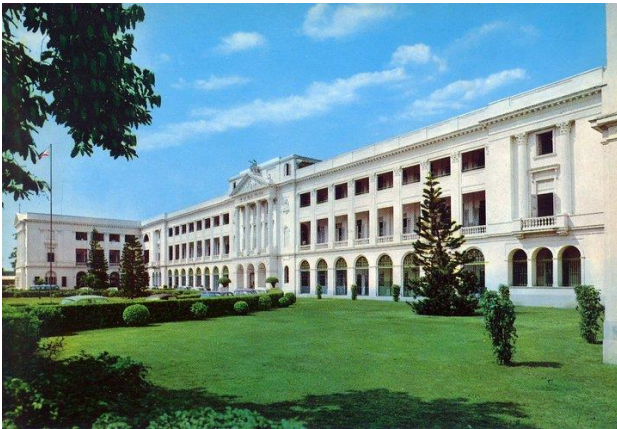
St. La Salle Hall

Emilio C. Yap Jr. Case Rooms LS218 and LS219, 2/F St. La Salle Hall De La Salle University (DLSU) 2401 Taft Avenue, Manila, Philippines