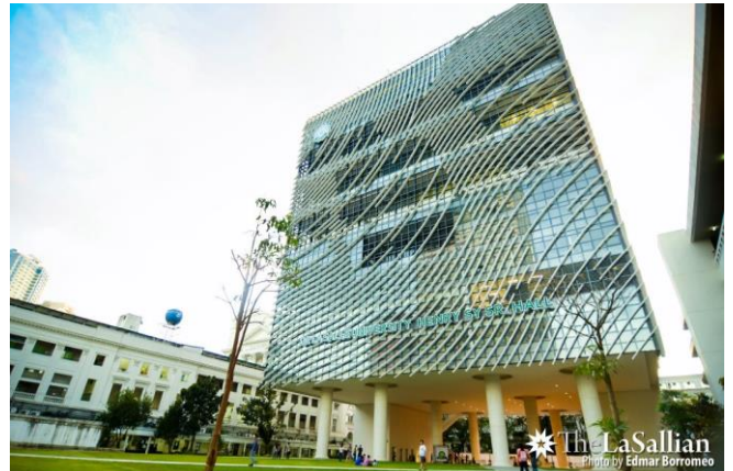
Henry Sy Sr. Hall

For the participants, please instruct the taxi that you are going to De La Salle University “Taft”, where it is located right beside the Vito Cruz Light Rail Transit (LRT) station.