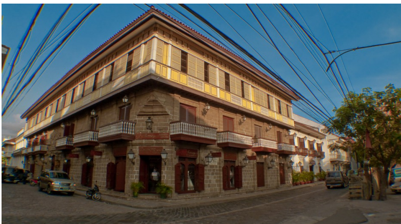
Casa Manila Museum